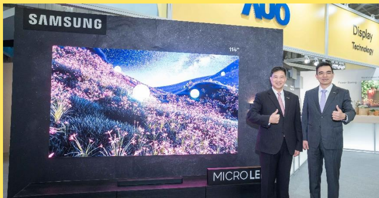
Samsung 114" Micro LED TV