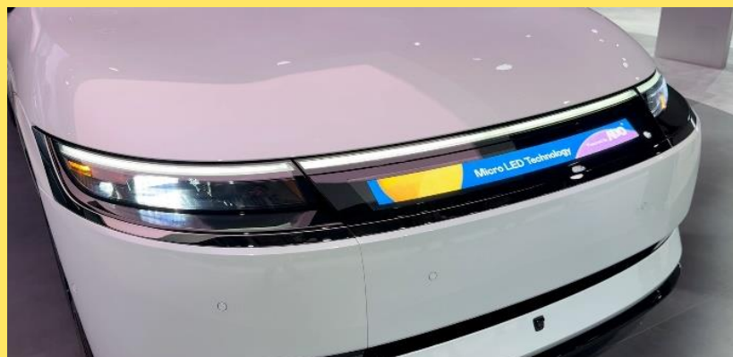
Micro LED media bar for AFEELA