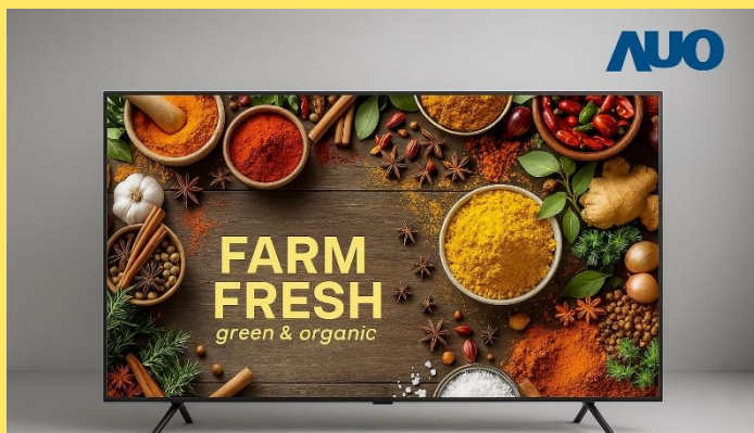
65" 8K FSC LCD