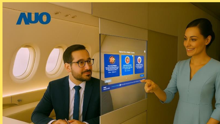
17.3" dual-side transparent Micro LED